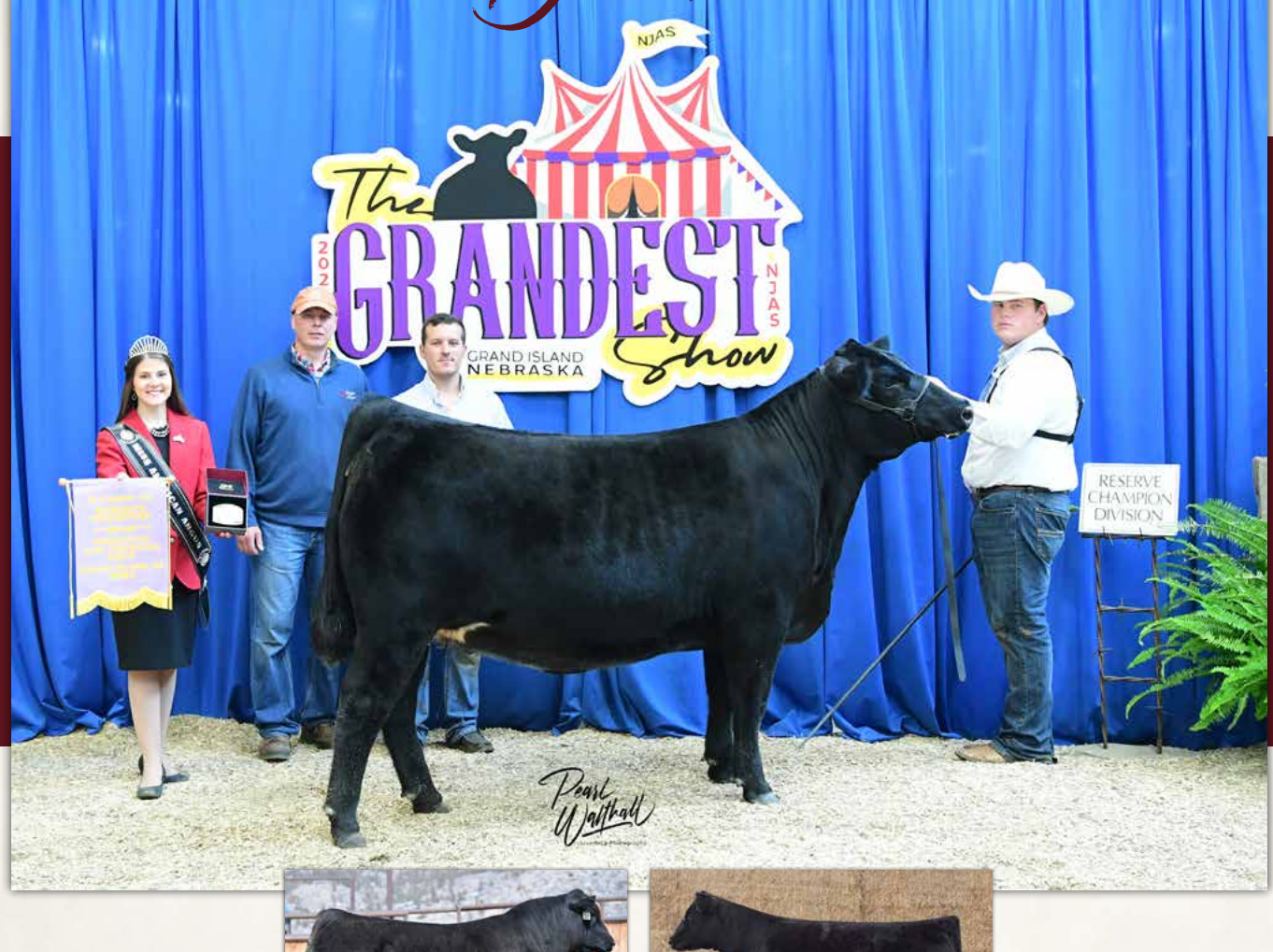
Deppe SFF Growth Fund 273 Son of Lot 1

Selling 1 IVF Cycle. Semen and flush cost provided by the buyer. Guaranteeing 6 viable frozen embryos, no cap. Work to be completed by TransOva Genetics, Sioux Center, IA.