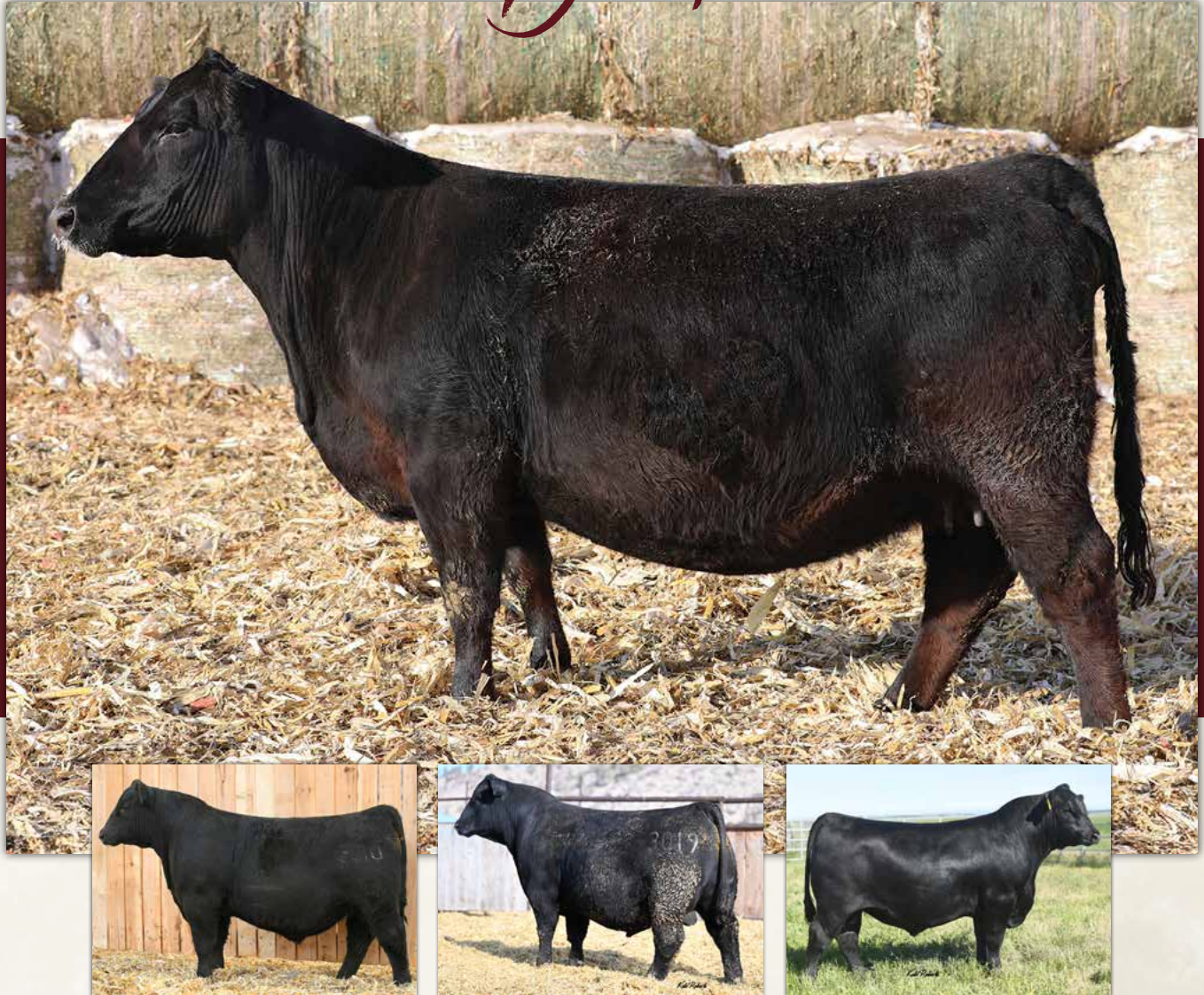
Deppe GAF Front-Runner 3010 Full-Sib to Lot 4 Embryo Mating