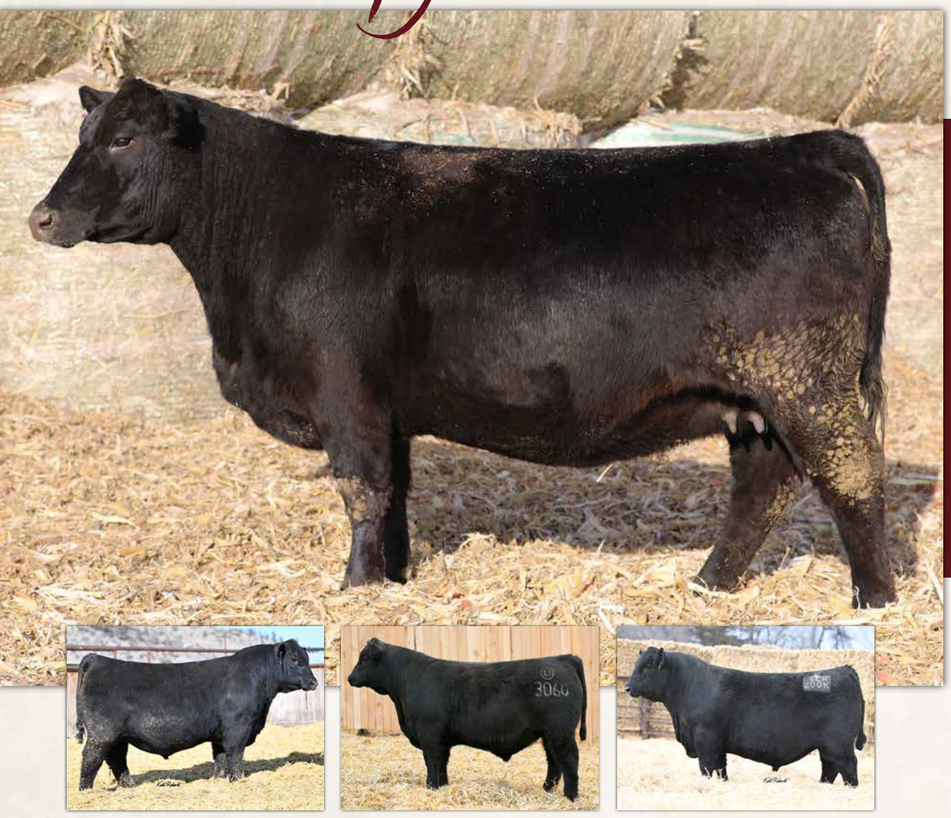
Deppe GAF Congress 3044 Son of Lot 5